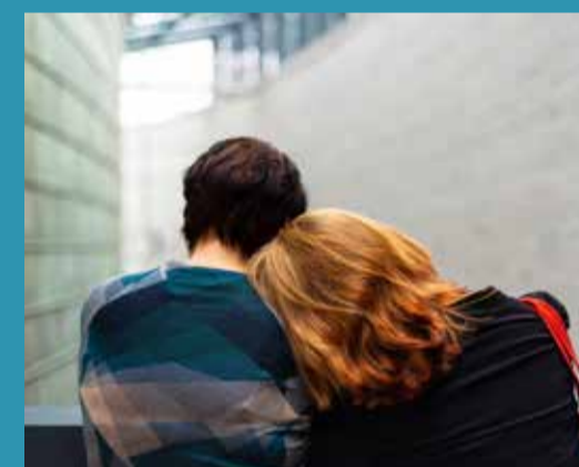
*Retrieved 18 December 2019 https://www.helpauckland.org.nz/sexual-abuse-statistics.html

prevention, by building greater awareness and community analysis of the issues of sexual and family violence. This involves challenging existing myths about the causes of violence in our community, particularly gendered ideas that shift responsibility from people who use violence and blame victims.