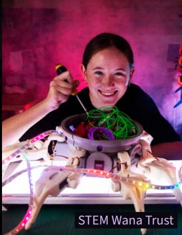
STEM Wana Trust