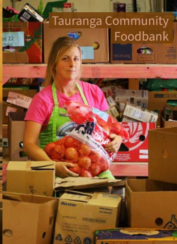
Tauranga Community Foodbank