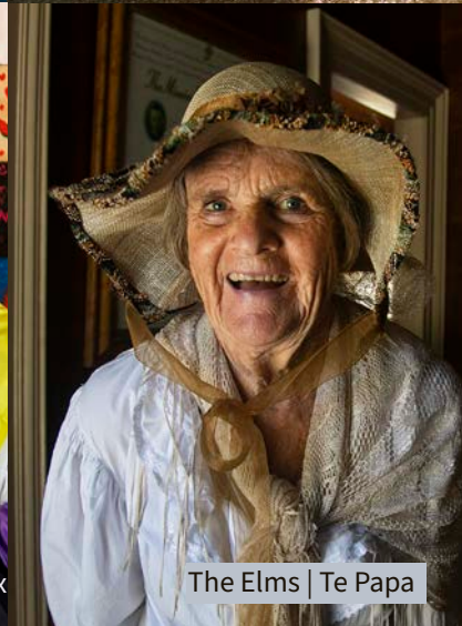
The Elms | Te Papa