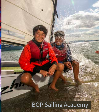
BOP Sailing Academy