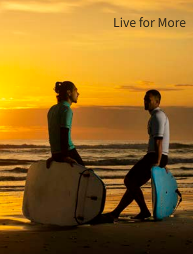
Live for More